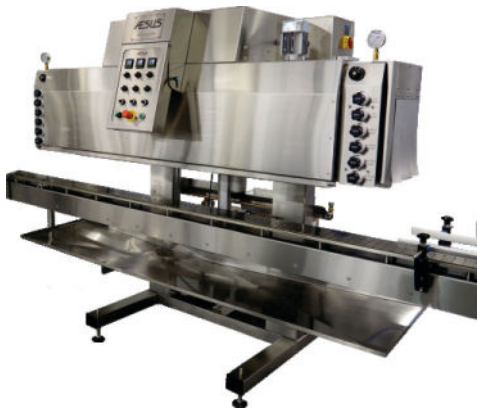
Hybrid Heat Tunnel