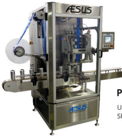
Premier Shrink Labeler

Up to 300 /min Servo controlled ShrinkSleeving and Neck Banding.