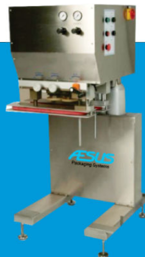
Delta Inline Cap Retorquer

Ultra Compact to 150/min neckbands and 60/min on Sleeving.