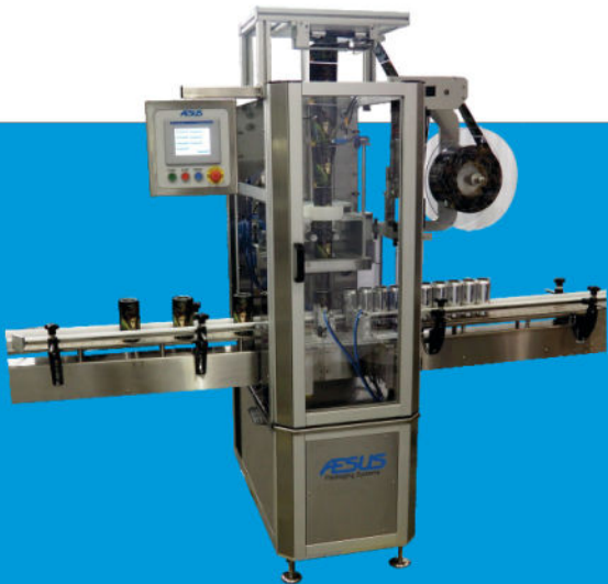
Eco Shrink Bander

Ultra Compact to 150/min neckbands and 60/min on Sleeving.