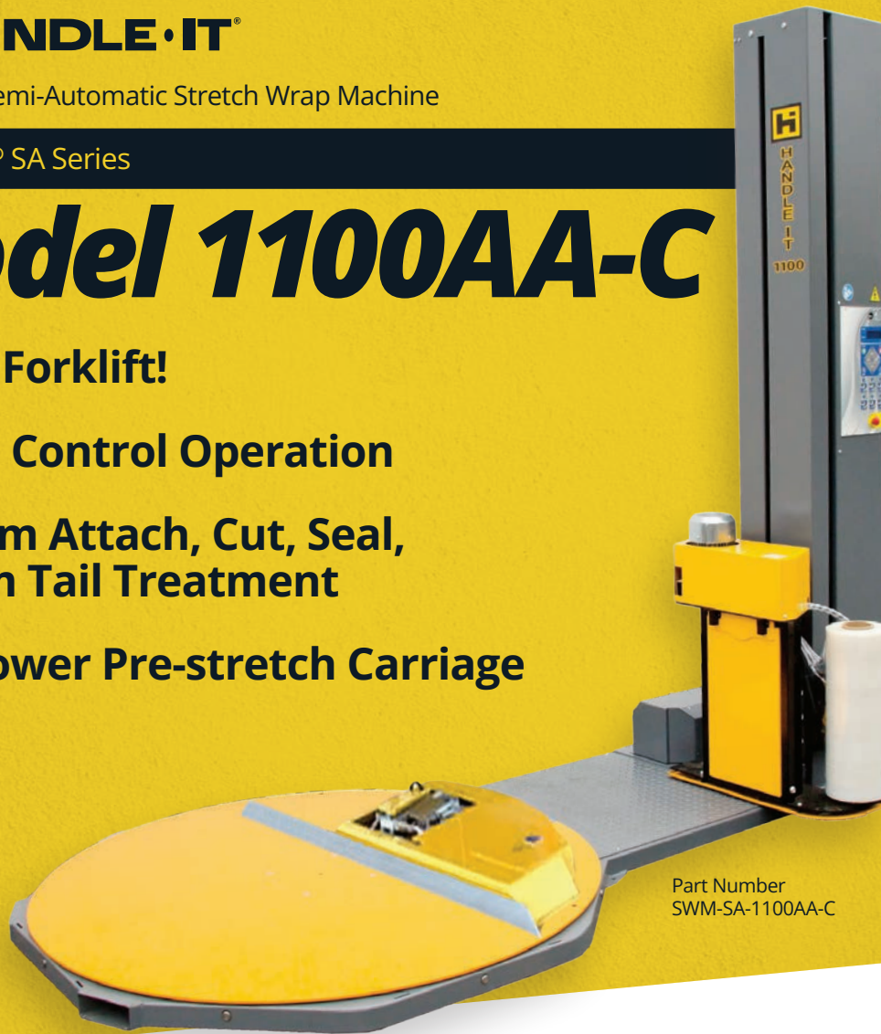
Part Number SWM-SA-1100AA-C