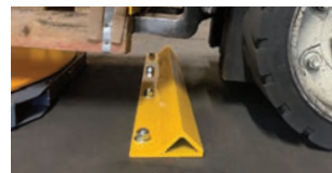
Forklift Wheel Stop