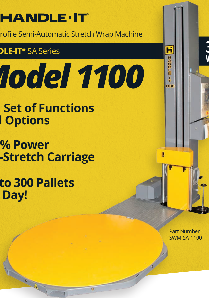
Part Number SWM-SA-1100