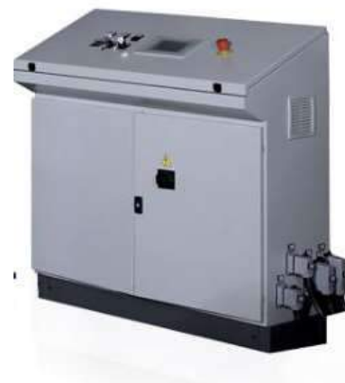
Intuitive HMI control board