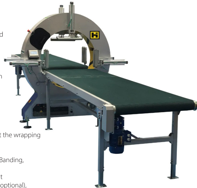
FA-90 with driven conveyors (optional) Top & lateral presses (optional)