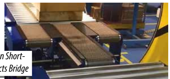
Driven Short-Products Bridge