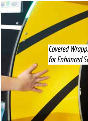
Covered Wrapping Mechanism for Enhanced Safety