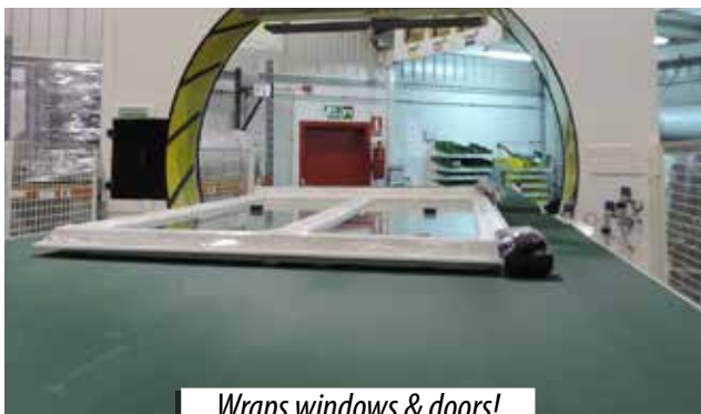
Wraps windows & doors!