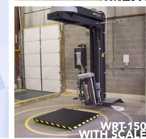
WRT-150 WITH SCALE