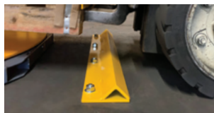
Forklift Wheel Stop