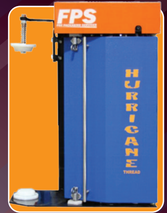
POWER DE-ENERGIZED WHEN CARRIAGE DOOR OPEN