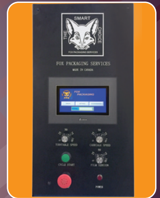
7" FULL COLOR TOUCH SCREEN