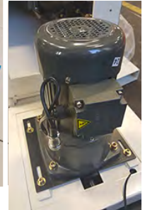
1HP Electric Motor