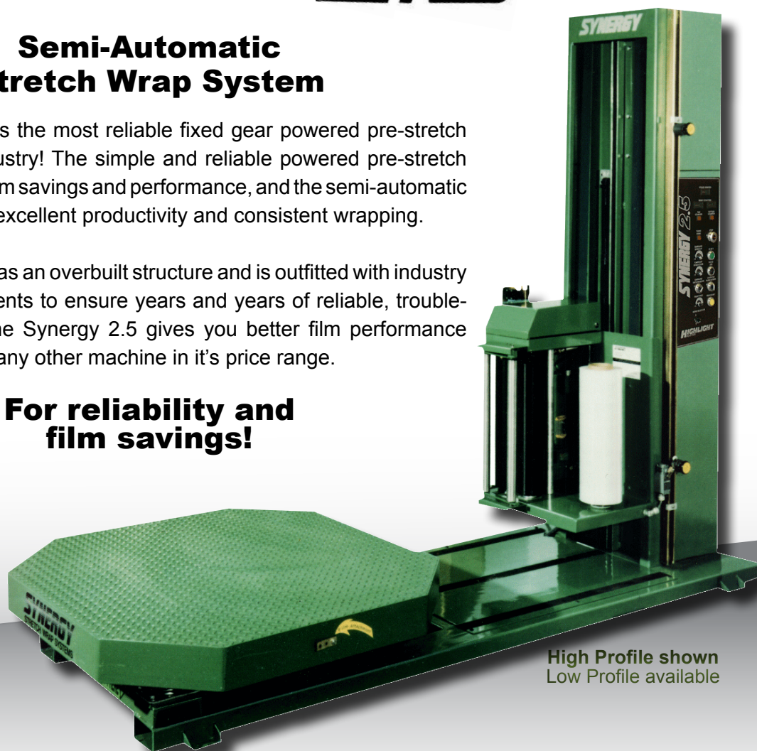
High Profile shown Low Profile available