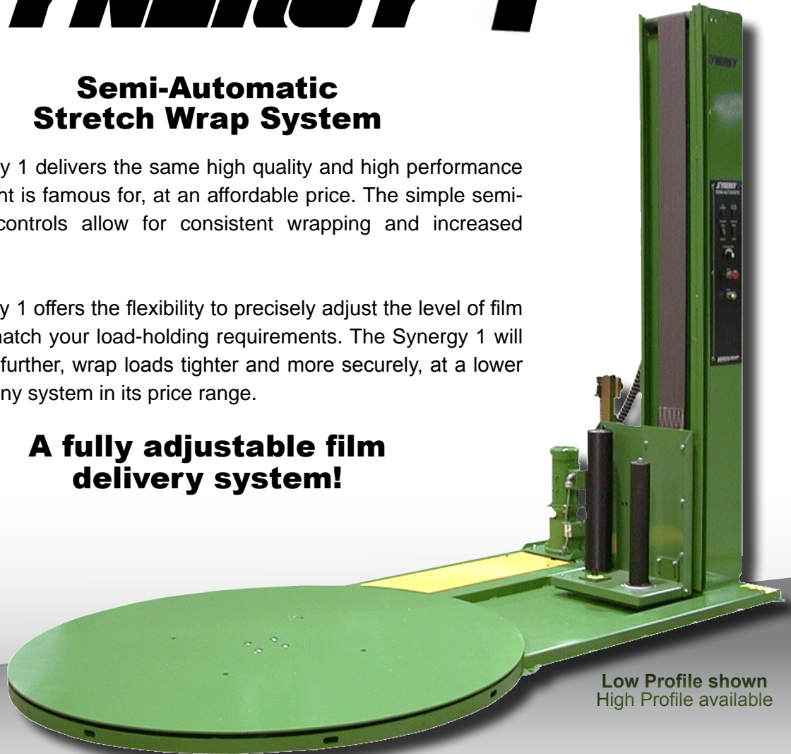
Low Profile shown High Profile available